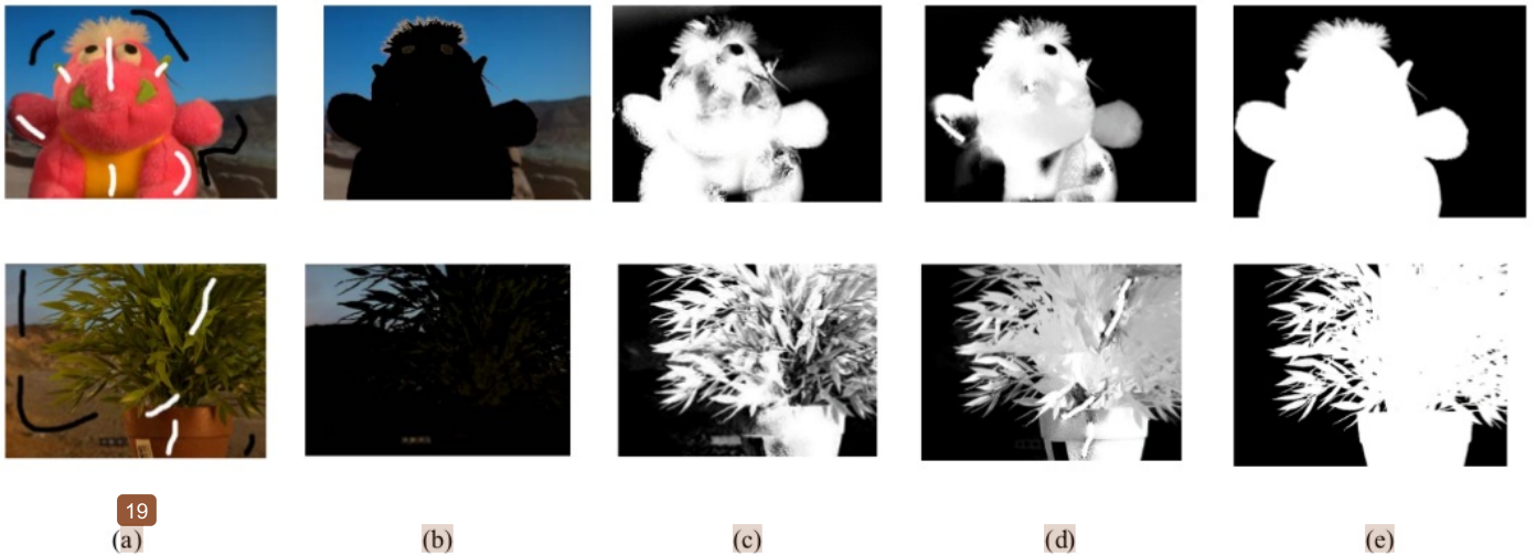
Figure 4. Example results of Our method :(a)Scribble image (b)Cluster 2 from K-means + CF (c)Alpha from K-means + CF (d)Alpha of CF (e)Ground truth image

of each dataset increased. It means this clustering-matting is more details than with basic Closed Form segmentation only.