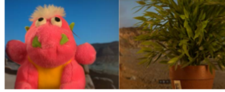
Figure 2. (a) Original Image: pinky doll, and plants with pot.