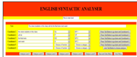
Fig. 2. The main level analysis in ESA

The analysis starts by segmenting the main level into constituents that together make up the sentence. The number of constituents that make up the sentence will determine the number of levels to be analyzed. For example, a sentence The clever students in this class will do the final tests next week is segmented into four constituents: constituent1 the clever students in this class , constituent2 will do , constituent3 the final tests , and constituent4 next week . Each constituent will be assigned function-category labels in its larger structure. In assigning function-category labels of a constituent, the user may choose the relevant function or category that corresponds to the constituent from a pull-down list. Whenever a particular level contains a constituent that is capable of further analysis, this analysis takes place on a lower level. The analysis of the main level of the above sentence can be presented in Fig. 2.