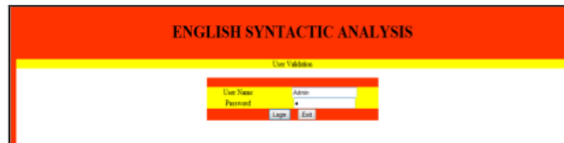
Gambar 1. Validasi pengguna

Halaman utama program aplikasi ini membutuhkan validasi pengguna, seperti pada gambar berikut: