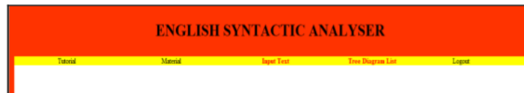
Gambar 2. Menu utama

Setelah memasukkan username dan password, menu utama program ini akan tampil, yang terdiri dari: Tutorial , Learning Materials , Input Text , Tree-Diagram List , and Logout .