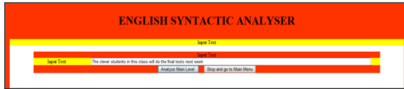
Gambar 3. Input text

Analisis dimulai dengan memecah konstituen-konstituen level utama, yaitu kalimat The clever students in this class will do the final tests next week . Jumlah konstituen yang membentuk kalimat tersebut akan menentukan jumlah level analisisnya. Apabila sebuah kalimat terdiri dari empat konstituen, maka tingkatan analisisnya akan sampai empat level.