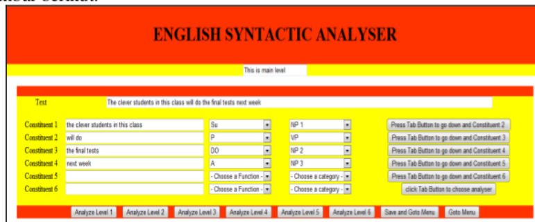
Gambar 4. Analisis level utama

Dalam menentukan label fungsi dan kategori dari sebuah konstituen, pengguna dapat menggunakan daftar pilihan pada menu pull-down sesuai dengan fungsi dan kategorinya. Apabila sebuah konstituen memiliki konstituen yang dapat dianalisis lagi, maka dilanjutkan ke analisis level bawah selanjutnya. Tampilan analisis level utama kalimat tersebut tampak seperti gambar berikut: