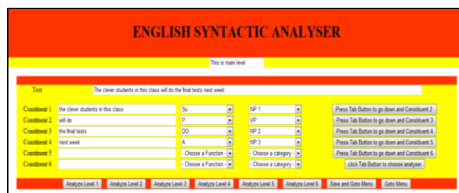
Fig. 2. The main level analysis in ESA

The analysis starts by segmenting the main level into constituents that together make up the sentence. The number of constituents that make up the sentence will determine the number of levels to be analyzed. For example, a sentence The clever students in this class will do the final tests next week is segmented into four constituents: constituent1 the clever students in this class , constituent2 will do , constituent3 the final tests , and constituent4 next week . Each constituent will be assigned function-category labels in its larger structure. In assigning function-category labels of a constituent, the user may choose the relevant function or category that corresponds to the constituent from a pull-down list. Whenever a particular level contains a constituent that is capable of further analysis, this analysis takes place on a lower level. The analysis of the main level of the above sentence can be presented in Fig. 2.