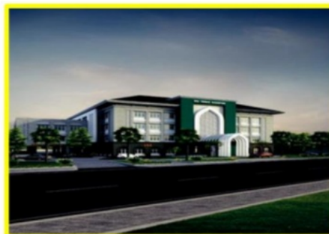
Fig. 2. Model plan of Tunas Harapan Islamic Hospital Salatiga [2]