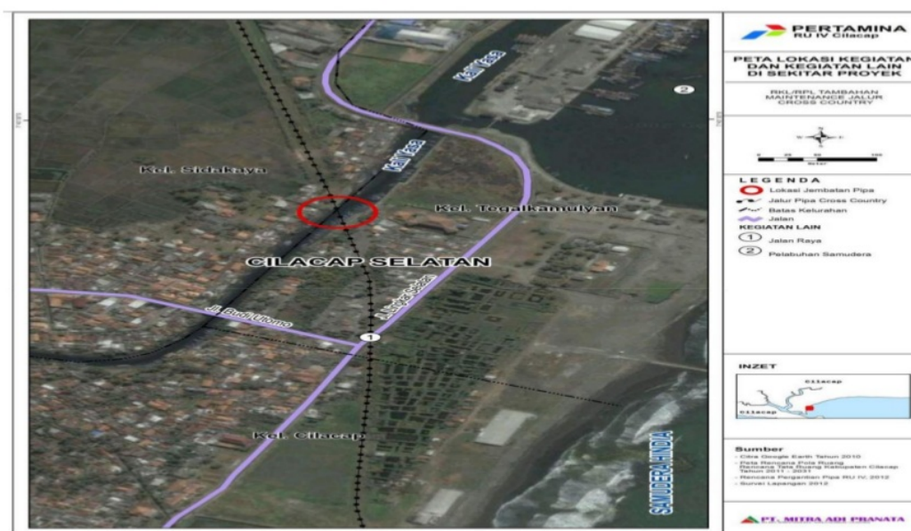
Figure 1: Location map of risk analysis of unit IV CILACAP pipeline maintenance activities in Kali Yasa Rivers.

The activity plan to be explored in this risk analysis study is the planned installation of crossing oil pipelines for the Kali Yasa Rivers from area 40 towards area 70 with the proponent planned activities are PT Pertamina Refinery Unit IV Cilacap. The scope of the study is the study of the Risk Analysis Plan for the Construction of a Cross Country Pipe in the Kali Yasa River located at the coordinate point of 109 ° 1'16,337 " East Longitude - 7 ° 43'36,365" South Latitude, in Figure 1, below: