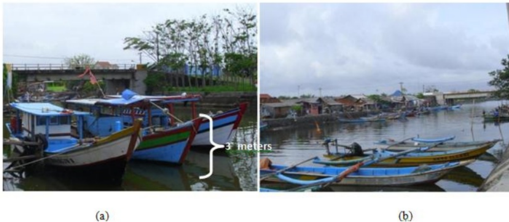
Figure 2: The ship used by fishermen around Kaliyasa Remarks a). Combrengh ships ship height; 3 meters and b). Fiber Ship.

The type of vessel used by fishermen around the location of the cross-country pipeline bridge construction activities has a height that is still below the planned height of a cross-country pipe bridge. Types of vessels such as comprengh have a maximum boat height of up to 3 meters from the surface of the water, so ships used by fishing communities around the construction site of cross-country pipelines when crossing the bridge will not cause collisions with pipes. Sail schedule: depart early in the morning at 03.00-06.00 WIB Returns at noon at 13.00-14.00 WIB. The type of vessel used by fishermen around the location of the cross-country pipeline bridge