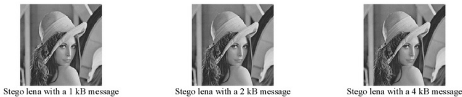
Figure 2. Sample Stego Image results

Table 1 shows that the results of the measurement of MSE and PSNR values, the value far exceeds the threshold of good manipulation image quality, which is 40dB [18]. The next test is to use a histogram. A histogram is the amount of intensity of the appearance of pixels. Message embedding results can change an image's histogram. This will certainly create suspicion that the data is embedded in the image. Based on the experimental results in Figure 3, histograms with different sizes of different payloads still look identical, which means the quality of the stego image is excellent [19]. Next, the extraction process must be done perfectly because steganography techniques require that messages can be conveyed properly without losing a bit [10]. Therefore, the extracted message needs to be tested by testing the Character Error Rate (CER) with the formula (8).