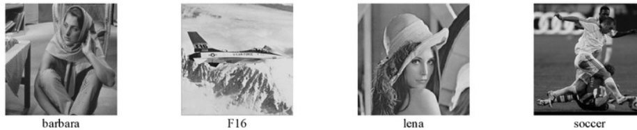
Figure 1. Host Image used

This study uses the host image shown in Figure 1. The image is a grayscale image with a size of 256 * 256. The host image will be embedded with a text message of 1 kB, 2 kB and 4 kB.