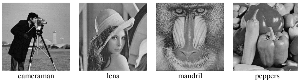
Figure 4. Cover Image Used

In this study used standard cover images such as cameraman, Lena, mandril, and peppers as shown in Figure 4. While the message image used is shown in Figure 5.