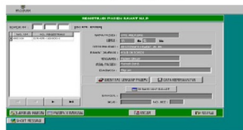
Fig. 3 Inpatient Registration