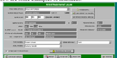
Fig. 2 Outpatient Registration

ProSIARS as media simulation lab consists of five main modules, modules acceptance outpatient (clinic), inpatient admission, the index of medical records, medical records and mutation assembling medical record. Each of these modules contain materials theory medical record needs to be set up as conditions and needs in the real world (the hospital). All of these modules with data input and reporting requirements as required in groups and integrated simulation. ProSIARS can be simulated and the media role plays in solving certain cases (problem-based learning PBL). PBL contextual learning theory and applied simultaneously go to fast, this method will help students to associate theory lessons with realistic aspects of the application of information systems in the hospital medical record. Pictures below are some examples of interfaces.